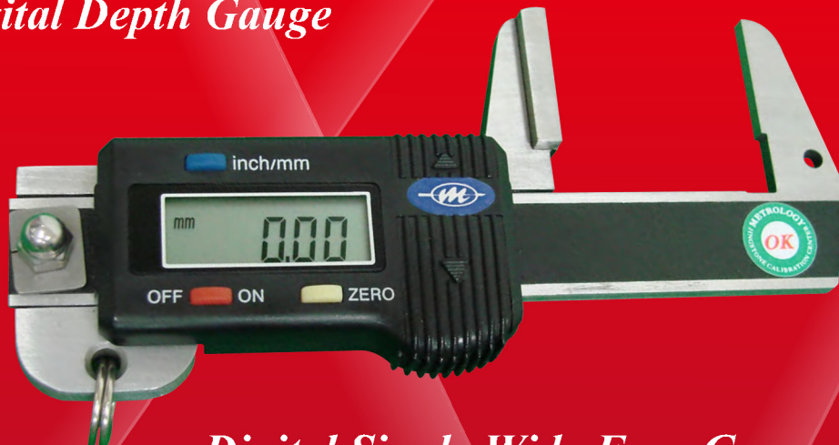
Digital Single Wide Face Gauge