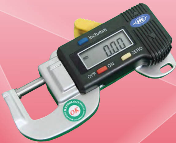
Digital Outside Snap Gauge