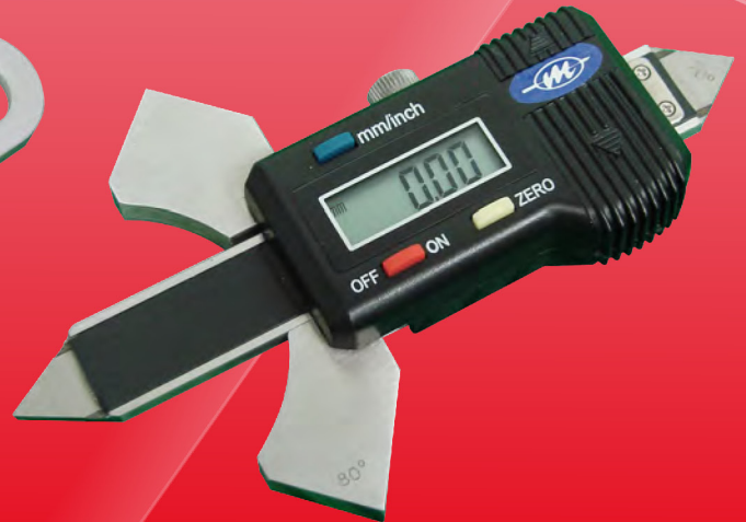
Digital Welding Gauge