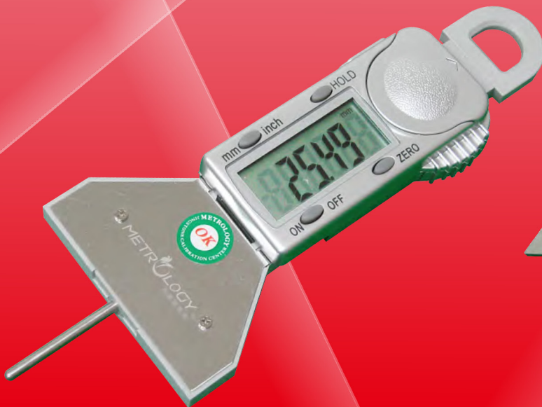
Digital Depth Gauge