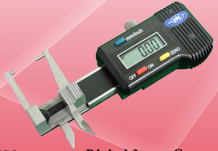
Digital 3-way Gauge