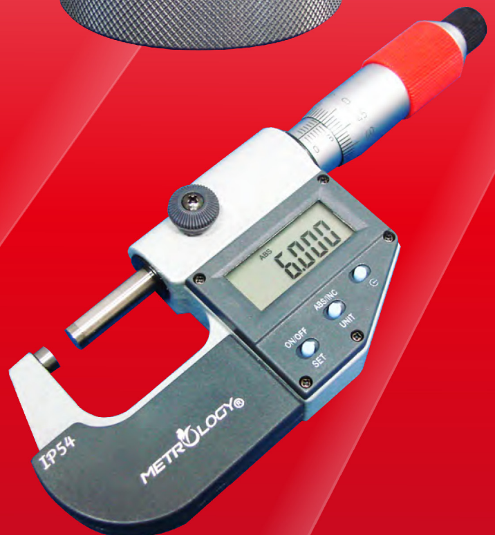
For special anvil types