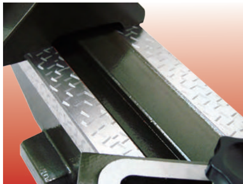
Precision grinding and scraping