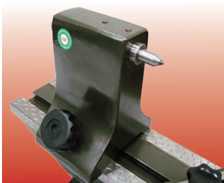
Fixed concentric slide

*Custom specifications available as per client's request (indicator optional)