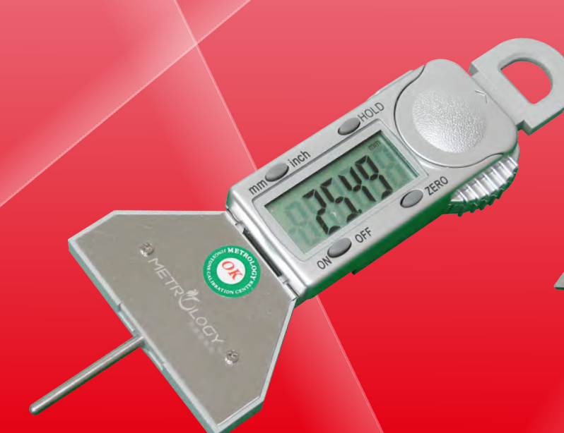
Digital Welding Gauge