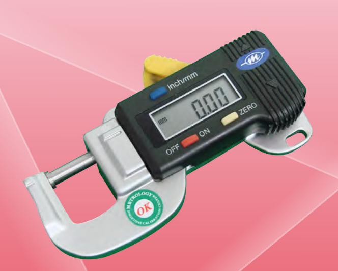
Digital Outside Snap Gauge