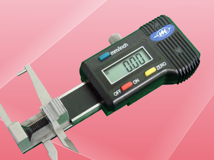
Digital 3-way Gauge